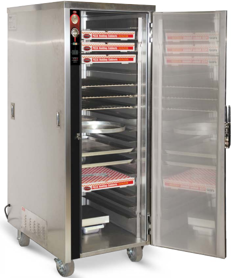
HEATED HOLDING PIZZA CABINETS FOR BOXES, TRAYS, SHELVES, AND PANS