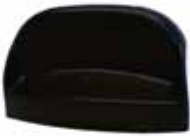
57141, 57204, 56833 cover handle