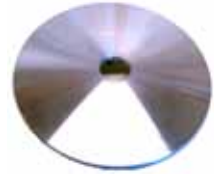
57130HP or 57131HP heating element